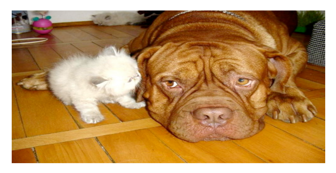
Introducing a Dog to Caged Pets

Some dogs can eventually be trusted around caged pets such as rabbits and gerbils, but some cannot. The first encounters between pets should be supervised. Some caged pets such as chinchillas and birds may be severely frightened by the presence of a dog. If this is the case, keep the caged pet in a room your dog can not get into.